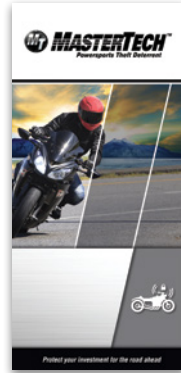
Powersports Theft Deterrent Brochure