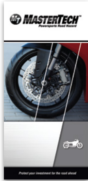
Powersports Road Hazard Protection Brochure